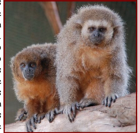
A C. oenanthe with an unidentified titi monkey