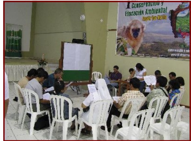
Participants in discussion during one of the workshops

end of the workshop a network was formed, that will be responsible for the implementation of the regional conservation and biodiversity. The Proyecto Mono Tocón will follow critically the developments, but will also be available for collaboration.