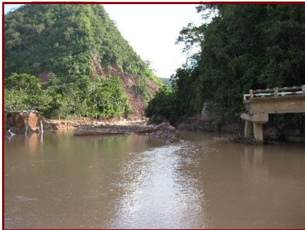
What was left of the bridge...

Until the day before its start, it was not sure if the congress could really take place. In the week preceding the congress we had the perfect example of the envi-